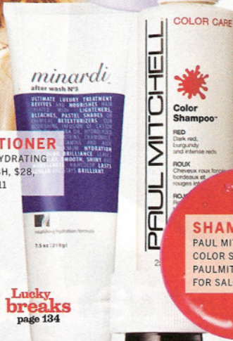
COLOR CARE Color Shampoo