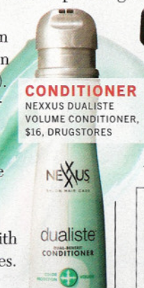
CONDITIONER NEXXUS DUALISTE VOLUME CONDITIONER, $16, DRUGSTORES