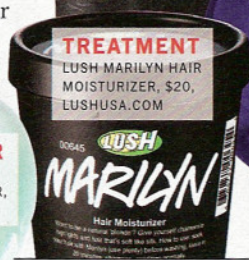
TREATMENT LUSH MARILYN HAIR MOISTURIZER, $20, LUSHUSA.COM