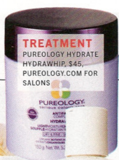
TREATMENT PUREOLOGY HYDRATE HYDRAWHIP, $45, PUREOLOGY.COM FOR SALONS