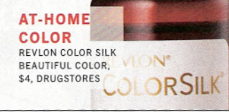
AT-HOME COLOR REVLON COLOR SILK BEAUTIFUL COLOR, $4, DRUGSTORES