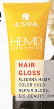
HAIR GLOSS ALTERNA HEMP COLOR HOLD REPAIR GLOSS, $19, BEAUTY.COM